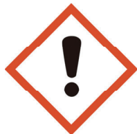
Chronic Health Hazards