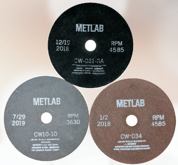
CUT OFF WHEELS

SOLUBLE OIL with rust inhibiting additive. For use with all abrasive cut-off machines and belt grinders which have contained recirculating systems. Blue, odorless, foam controlled. Sulfur and nitrate free. Mixture 40