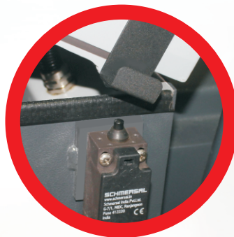
HOOD SAFETY LATCH