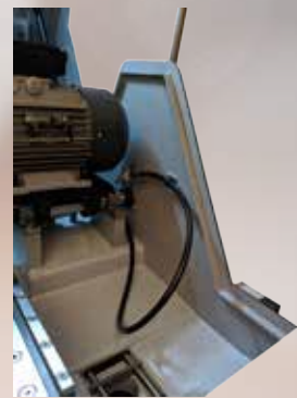
CHAMBER CLEANING NOZZLE