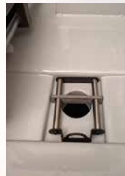
EPOXY COATED CHAMBER