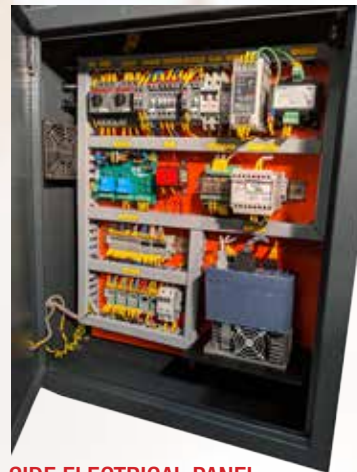
SIDE ELECTRICAL PANEL