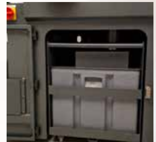
RECIRC TANK IN CABINET