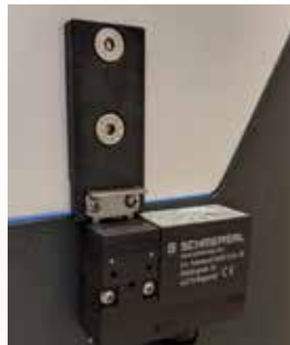
HOOD SAFETY SWITCH