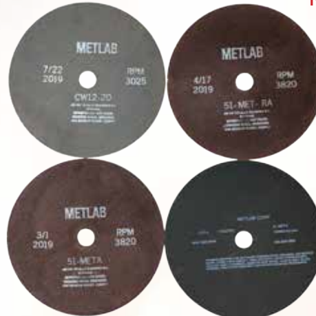
CUT OFF WHEELS