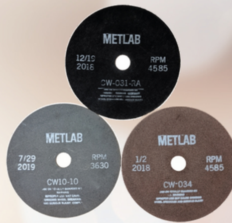
CUT OFF WHEELS