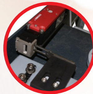
DOOR SAFETY INTER LOCK