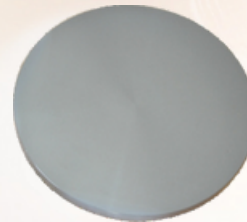
Wheel ( Disc )

Automatic / Manual with variable Dosing Unit (3 x Diamond Suspension and 1 x Lubricant)