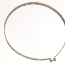
Cloth holding Paper