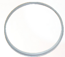
Paper Holding Band