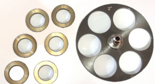
Spacer & Sample Holder