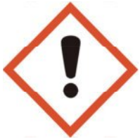
Chronic Health Hazards